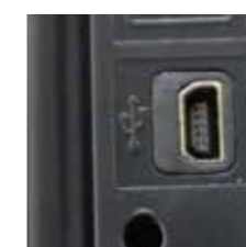
Detail of USB connection